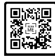
BP Football Venmo

Payment: Please pay via Venmo or mail check payable to “Bethel Park Football Boosters”, and send to PO Box 261, Bethel Park, PA 15102